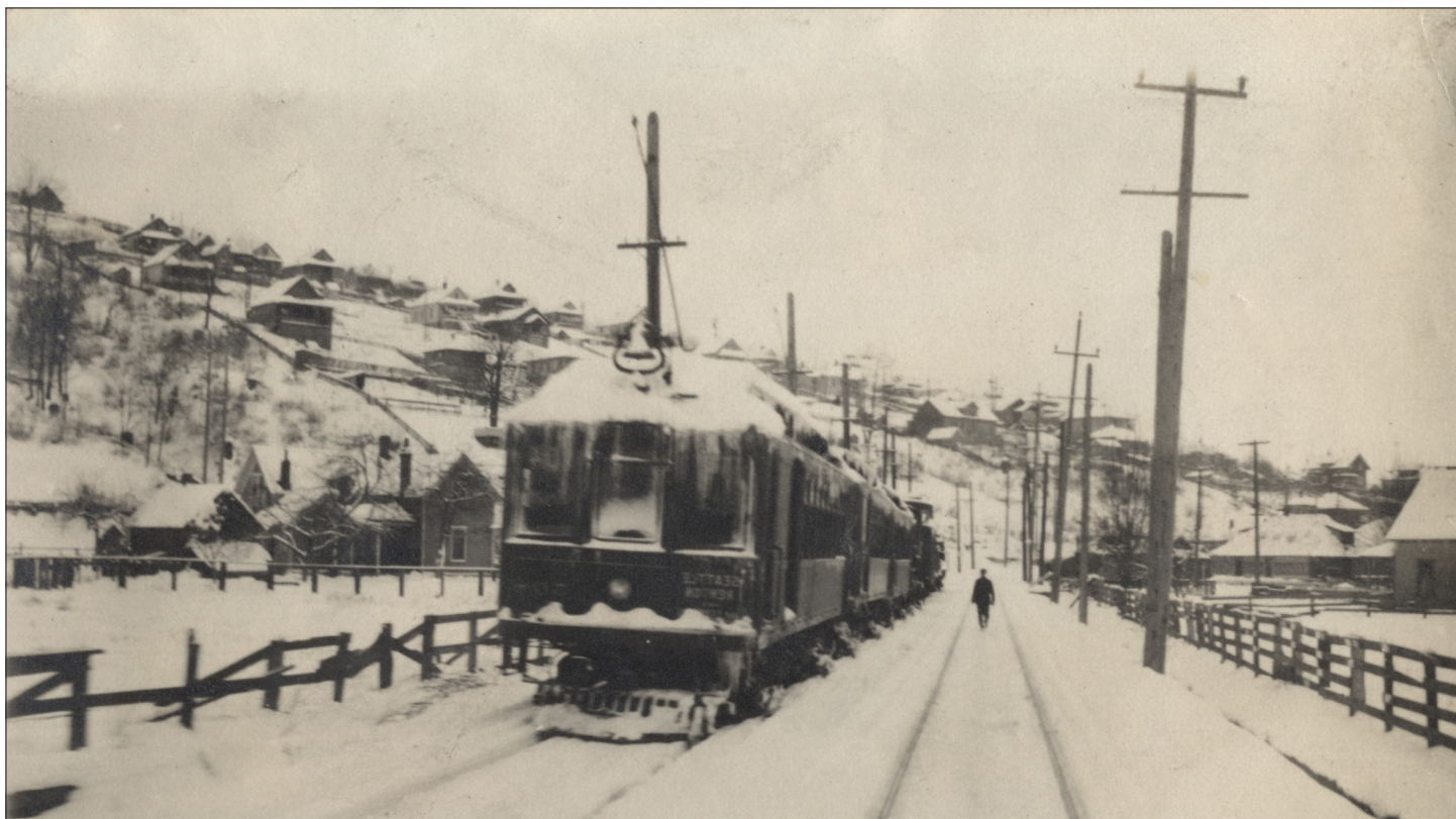
Train on Main Street in the snow, 1916. Renton Hill is on the left.