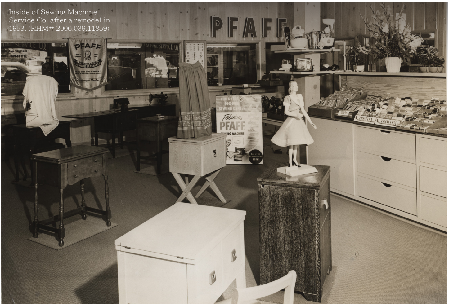
Inside of Sewing Machine Service Co. after a remodel in 1953.