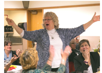
A raffle winner celebrates!