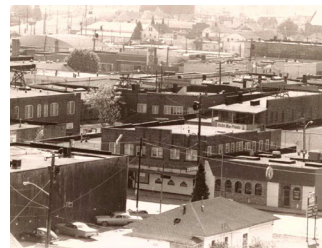
Renton businesses are a microcosm of the effects of larger economic forces.