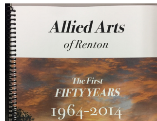
Allied Arts of Renton's 50 years.