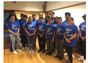
Renton Youth Council provided excellent dinner service to the event’s guests.